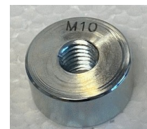
Thread Adapter, incl.